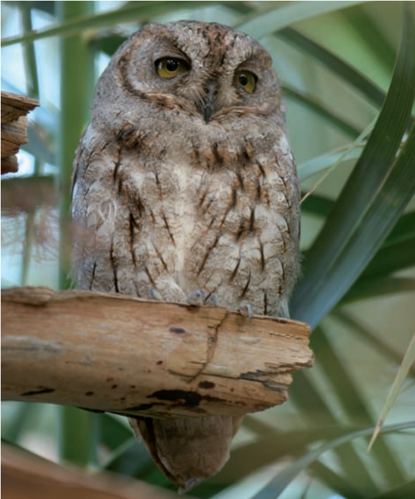
Plate 19: The call of the Socotra Scops Owl Otus socotranus is clearly different from that of the two other Otus species breeding in Arabia and is said to be similar, if not identical, to that of the Oriental Scops Owl Otus sunia . (Socotra Island, Yemen; January 2006; Photo: H. & J. Eriksen)