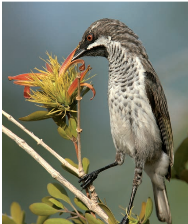
Plate 22: The distinctive Socotra Sunbird Chalcomitra balfourii is a widespread endemic on Socotra Island. (Socotra Island, Yemen; January 2006)