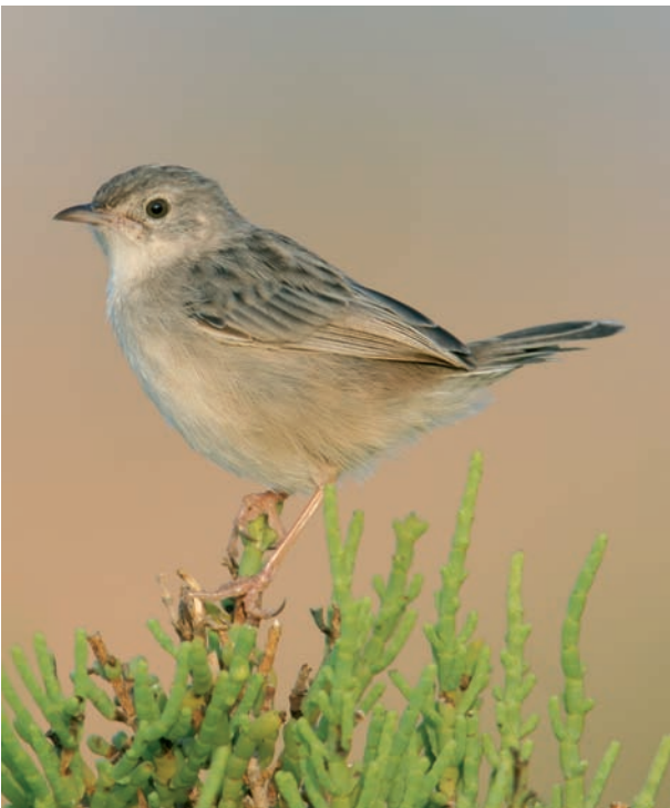
Plate 21: The Socotra Cisticola Cisticola haesitatus , endemic to Socotra Island, is closely related to the widespread Zitting Cisticola Cisticola juncidis of the Arabian mainland. (Socotra Island, Yemen; January 2006; Photo: H. & J. Eriksen)